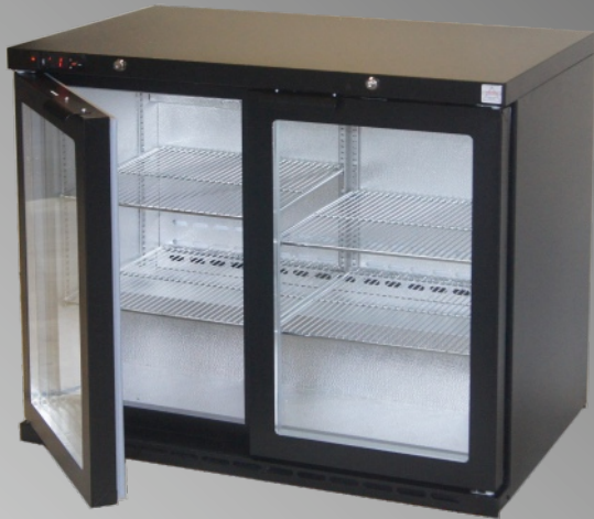
805mm Standard Height Range